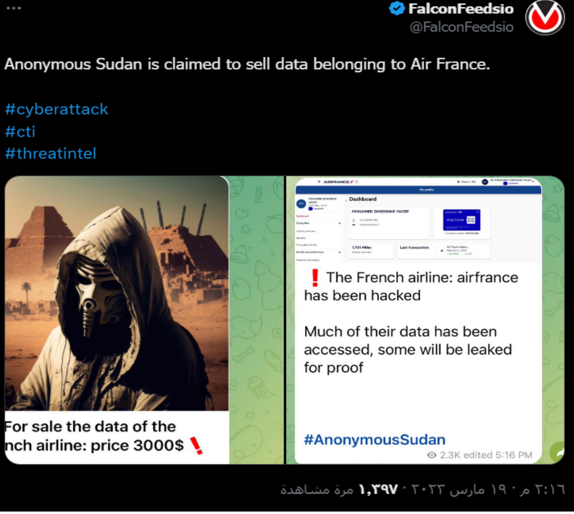
Figure 1: Air France Data Allegedly Sold by Anonymous Sudan

Several reports linked Anonymous Sudan with DDOS attacks on Benjamin Netanyahu's website and other Israeli organisations in April.